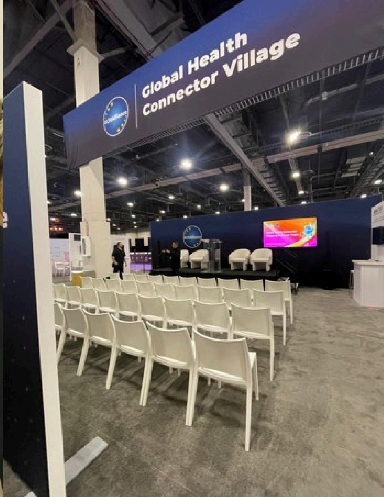
Connect & Convene @ Global Health Connector Village